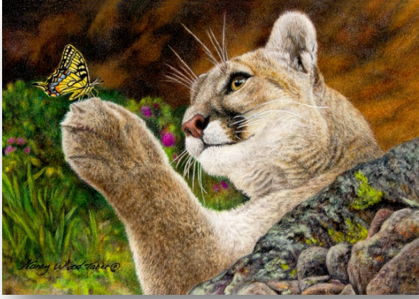
Nancy Wood Taber, colored pencil drawing Site #1

Site #1, Anasazi Fields has always been a cozy and pleasant venue with a rustic decor and a fire crackling in the fireplace. Homemade organic goat cheese and delectable chocolates and local honey make great gifts. New this year, Kaktus Brewery from Bernalillo will be offering glasses of their unique home brewed blends of beer and wine to the public.