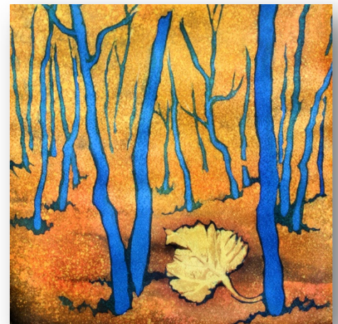
Bunny Bowen, painting on silk Site #3

For more information, contact: Nancy Couch (505) 867-2450, info@placitasholidaysale.com